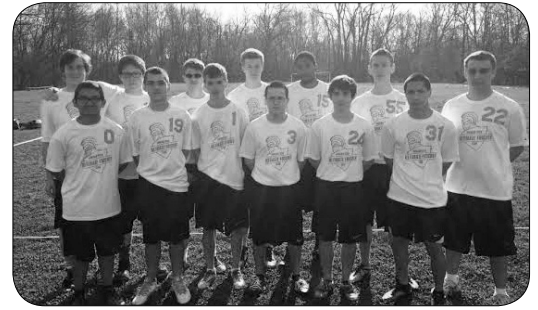
Ultimate Frisbee is quickly gaining popularity on the Indiana Tech campus.