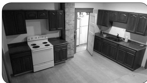
The newly remolded kitchen contains ample room for brothers to store their belongings.

The first project is to continue remodeling the academic wing, previously used as sleeping quarters, which currently consists of donated tables, desks and chairs from the old location of the Indiana Tech McMillen Library. After the library moved to the newly erected Academic Center, the old