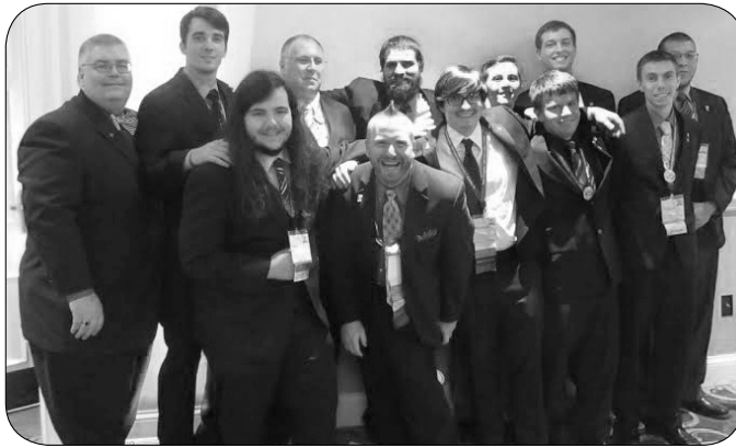
Indiana Eta brothers gather in August 2015 for the 54th Grand Chapter Conclave in Nashville, Tennessee.