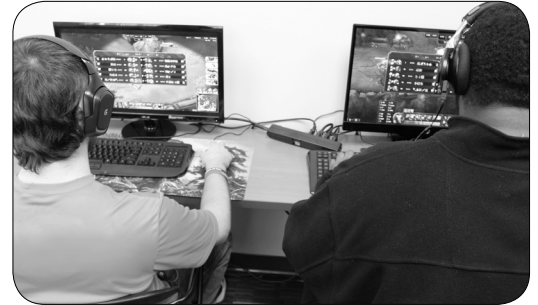
League of Legends, recognized as being an eSport, is a team-style online game allowing college teams to compete against each other.